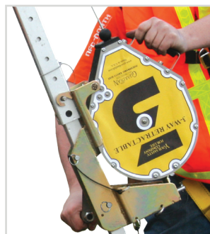
Compatible with Arc-O-Pod #10530