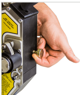
Instantly changes between normal and rescue mode